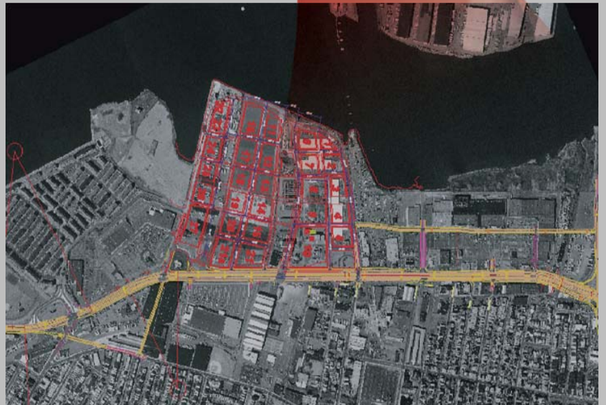
*Traffic analysis and schematic design for roadway improvements along Route 440 from Danforth Street to Sip Avenue Honeywell Mixed-Use Development - Jersey City NJ