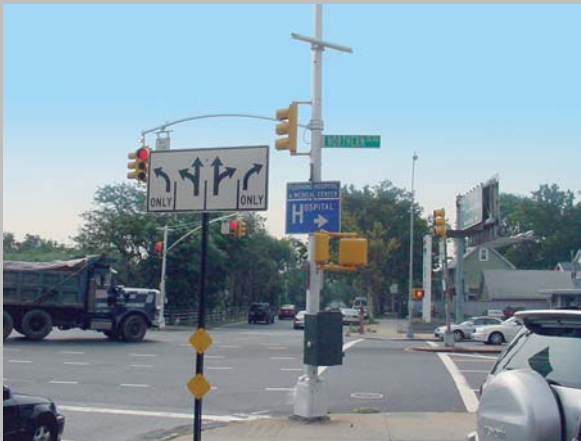
Regional Design Services Agreement (RDSA), NYS Dept. of Transportation Region 10 - Nassau & Suffolk Counties, NY

KS Engineers, P.C. ( KSE ) provides a full range of professional engineering, design and survey services customized to be compatible, environmentally sensitive, economically feasible and community focused in meeting our clients' needs and objectives. We work in partnership with our state, county, local and institutional clients to deliver the best possible solutions to today's difficult challenges on toll roads, interchanges, controlled access highways, park and rides, arterial highways, country and municipal roadways and streets, and inner-city networks. From concept development and preliminary engineering, including design alternatives and context sensitive solutions, through final design and construction support, KSE has the knowledge, experience and understanding to deliver high quality, sustainable engineering solutions for improved mobility and economic vitality.