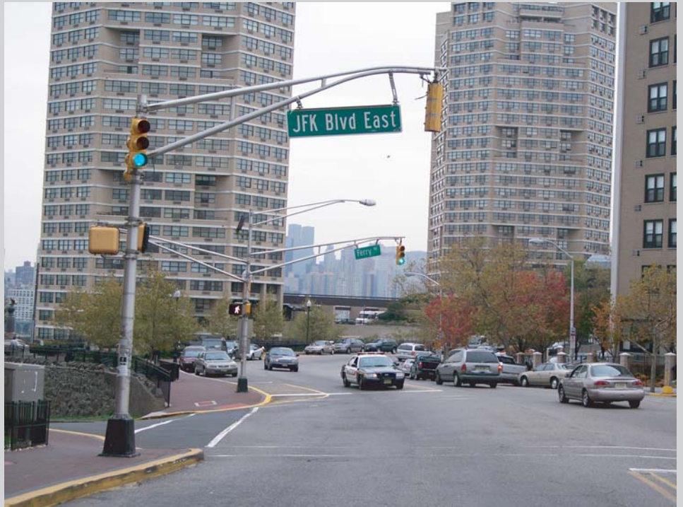
Design and Construction Management for Traffic Signal Improvements to Seven (7) Intersections – Package “R” in Jersey City, Union City, North Bergen, West New York and East Newark, NJ