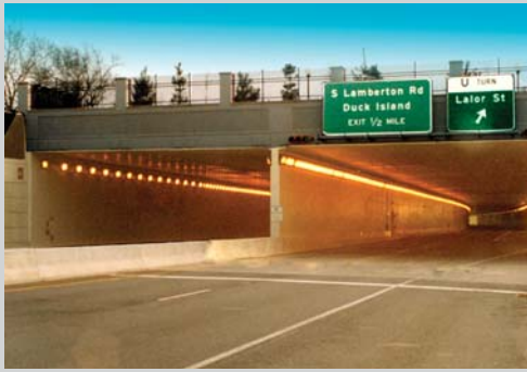
Route 29 Tunnel, Signalized Intersections, Roadway Lighting Design - NJDOT