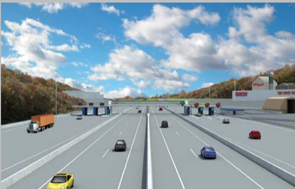
*Traffic study at the Yonkers Toll Plaza to examine the impact of constructing highway speed lanes at the toll plaza - New York State Thruway Authority