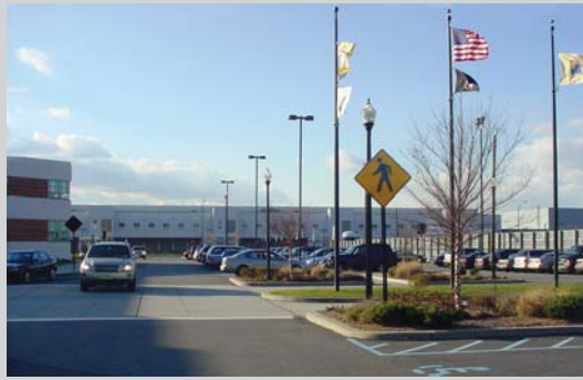
Traffic Engineering Services as Requested on a “Call-In” Basis During 2003, 2004, 2005, 2007, 2008 & 2009 - 2011 PANYNJ