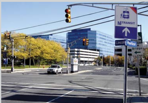
Traffic signal Improvements for over 45 Intersections - Hudson County NJ