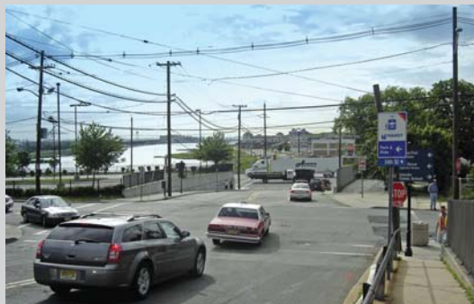
Design of two intersection in Bayonne - City of Bayonne, NJ