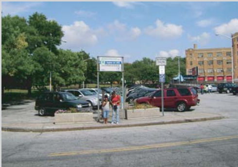
Yonkers Parking Study City of Yonkers, NY